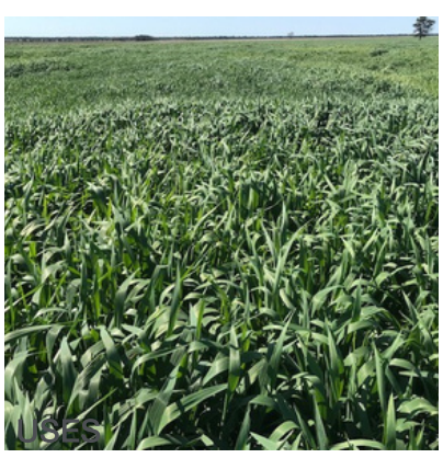
USES suited to all livestock types, silage and hay